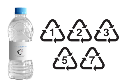
PLASTIC (Clear or Colored*) Label #s 1, 2, 3, 5 & 7

NOTE: Items must be clean, with non-paper items rinsed and labels removed.