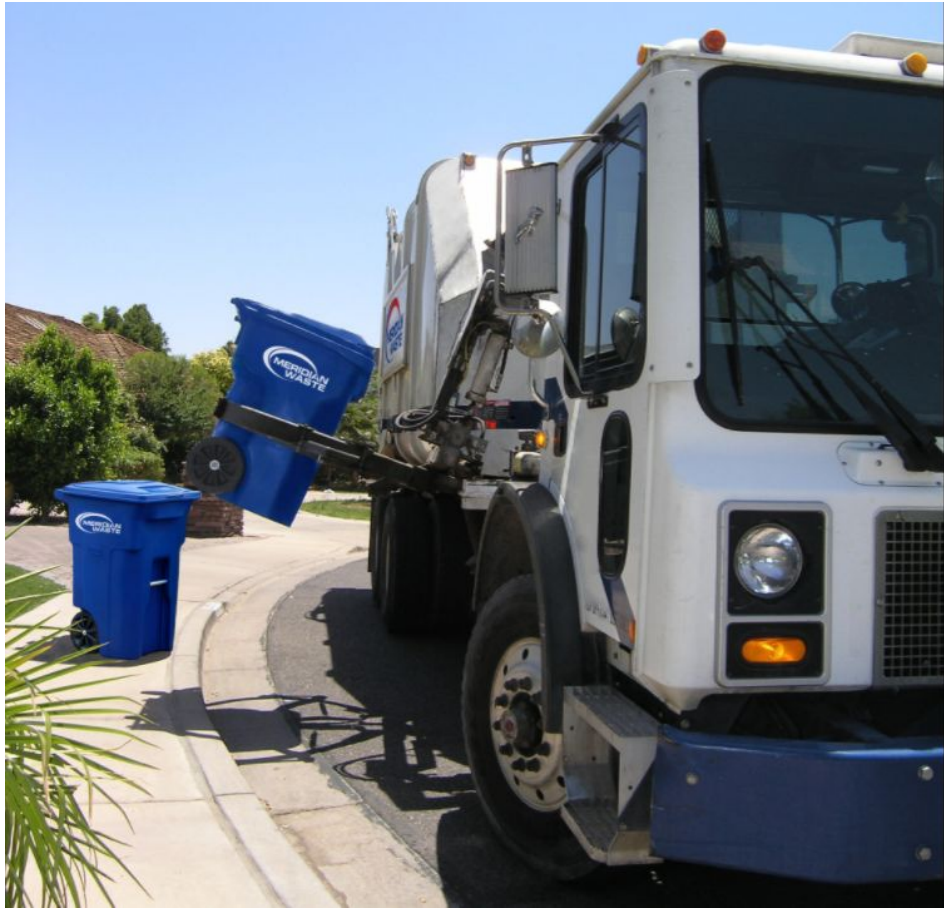
Graphic 1: Meridian Waste Charlton County Garbage Collection Guidelines available for download or print at MeridianWaste.com/CharltonCo .